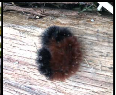
Woolly Bear Caterpillar