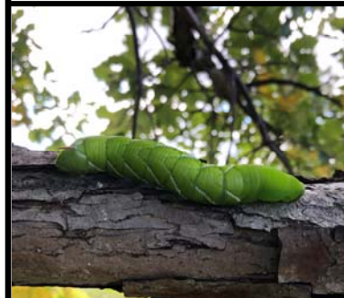
Luna Moth Caterpillar